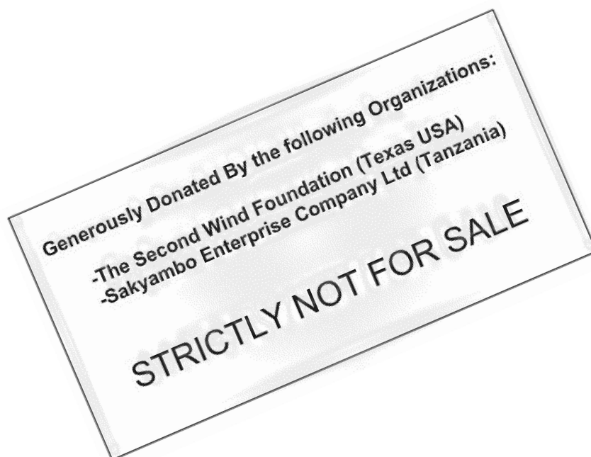
Exhibit 3: Each book is stamped and accounted for prior to distribution