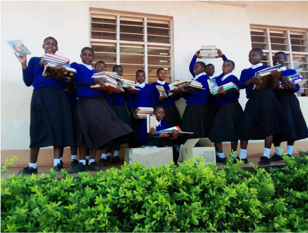
Exhibit 8: Delivery of books to Linda Secondary School