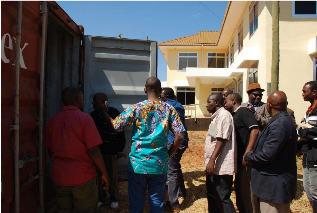
Exhibit 6: Mbanga District Council members inspecting the delivery on 8 th September 2019