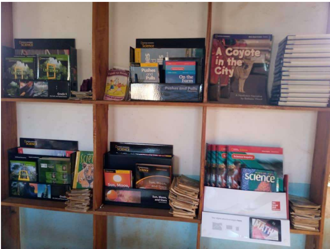
Exhibit 11: Books arranged in shelves at Matekela Library, Villagers and students have access to read