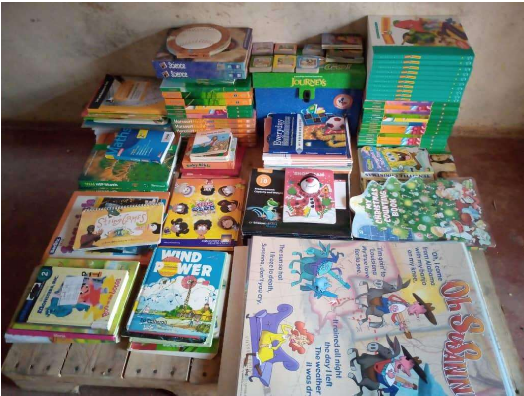
Exhibit 10: The books are arranged in related education fields as soon after being received at Matekela Library