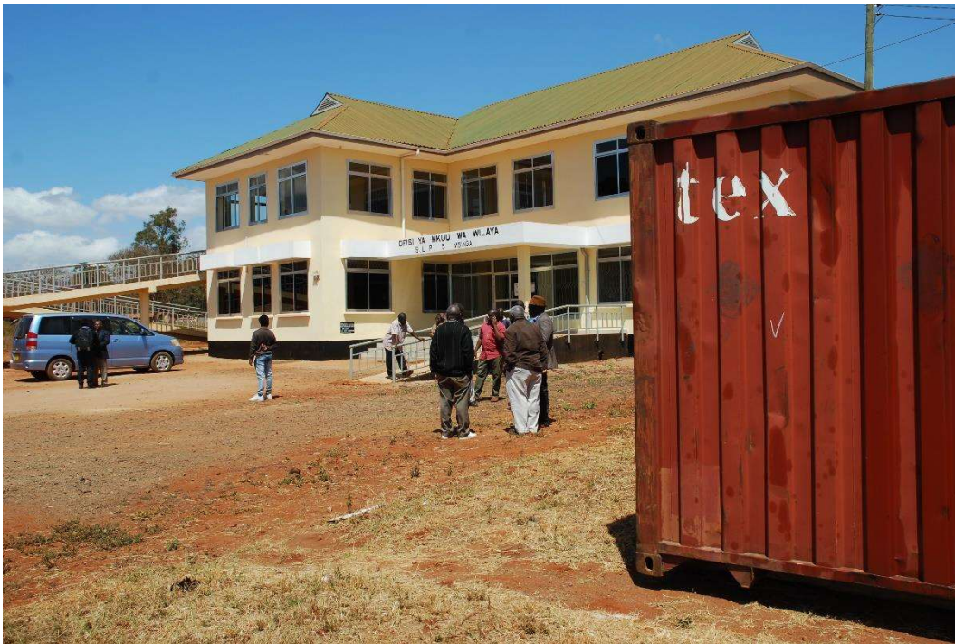
Exhibit 4: Container was delivered to Mbanga District Council Office on 25 th August 2019