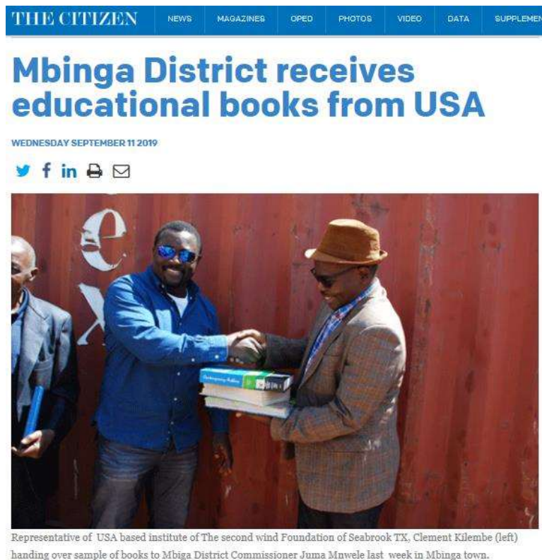
Exhibit 2: Newspaper article in the Citizen newspaper covering the official hand over of the container

We received a formal request from Mbinga in January 2019 and the container arrived at the port in Dar es Salaam in July 2019. It was cleared and transported to Mbinga, a town on the shores of Lake Malawi some 1,200km from Dar es Salaam. The container was delivered on 25th August 2019 and officially handed over on 8 th September, 2019 .