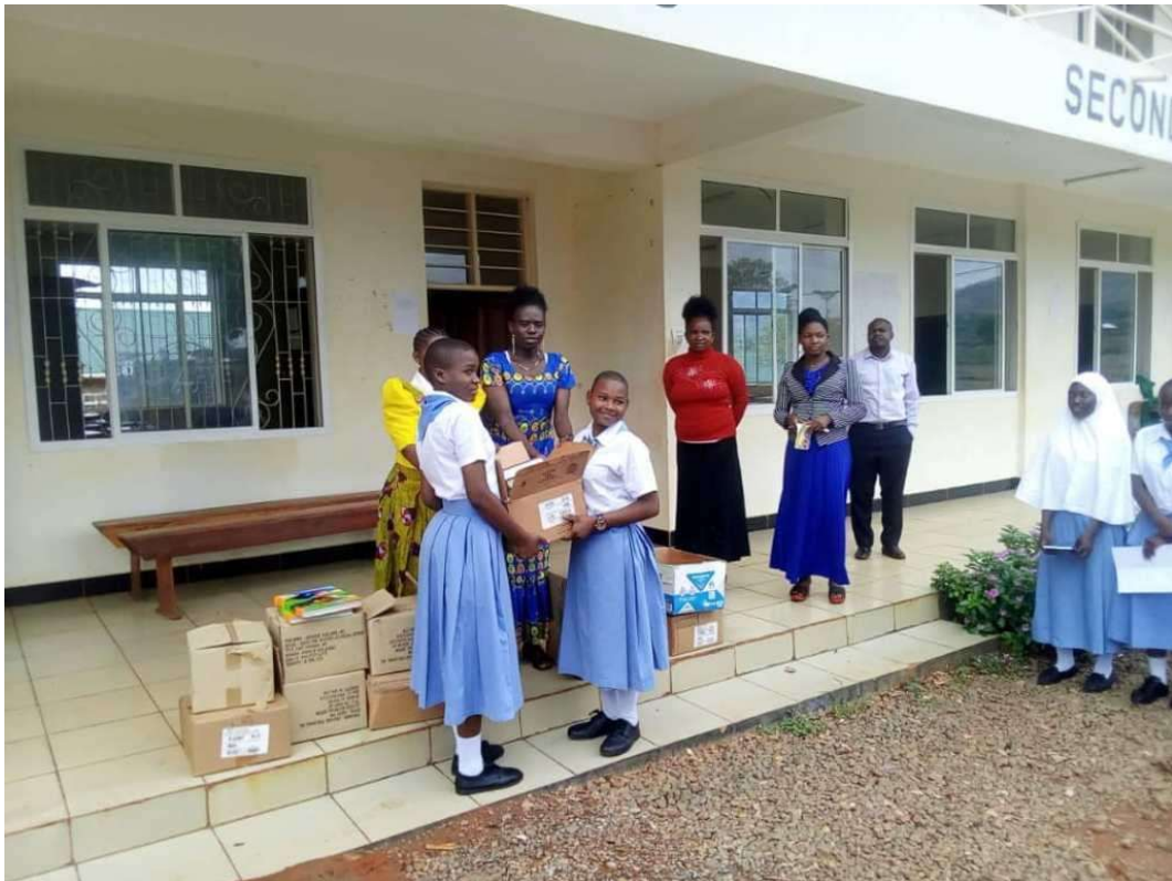
Exhibit 7: Delivery of books to Mbanga Girls secondary School