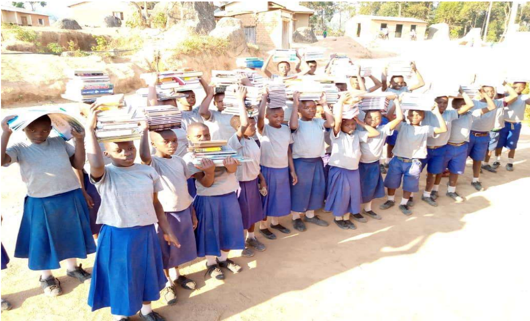
Exhibit 9: Matekela students' receiving books allocated for Matekela Library