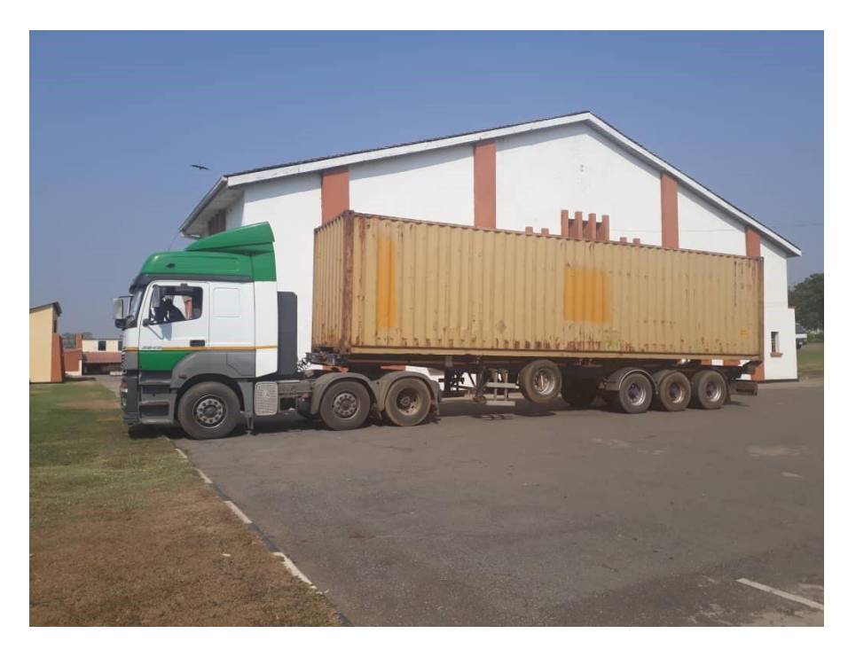
Exhibit 4: Container Arrives on 19tt September 2020