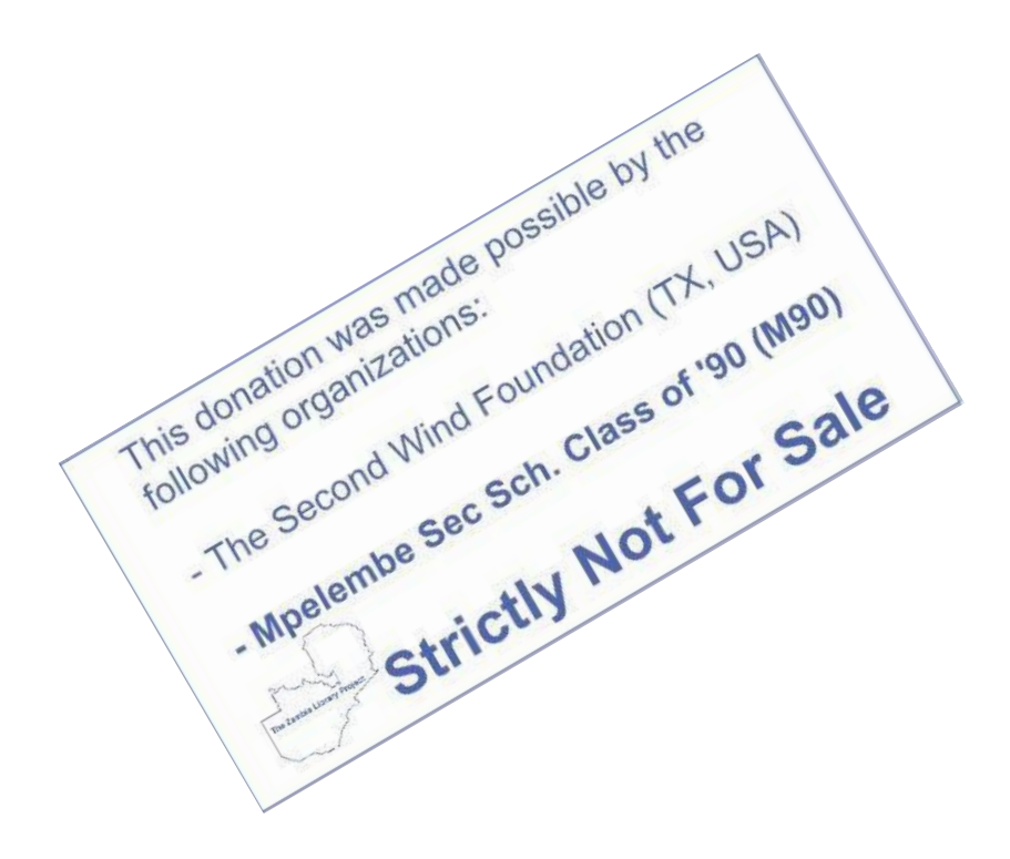
Exhibit 5: Each book is stamped and accounted for prior to distribution