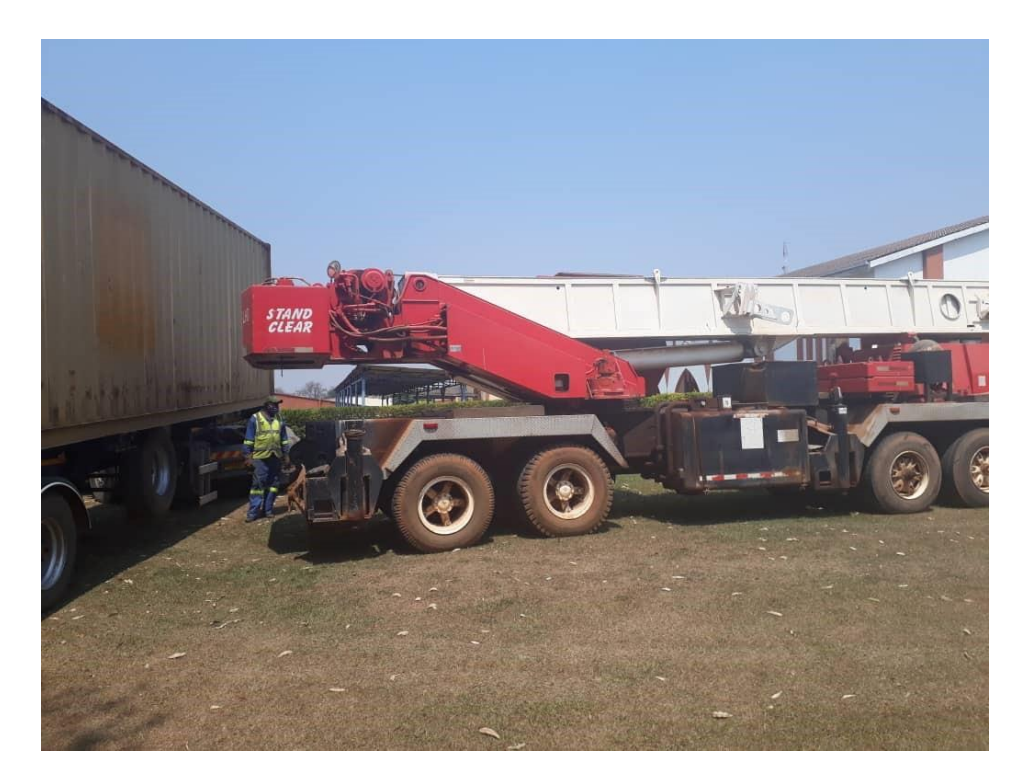
Exhibit 2: Crane Offloading Container in Kitwe

This container was officially handed over on to the school and community on Tuesday 22nd September 2020. The books where then distributed to 16 schools in Kitwe and surrounding districts: