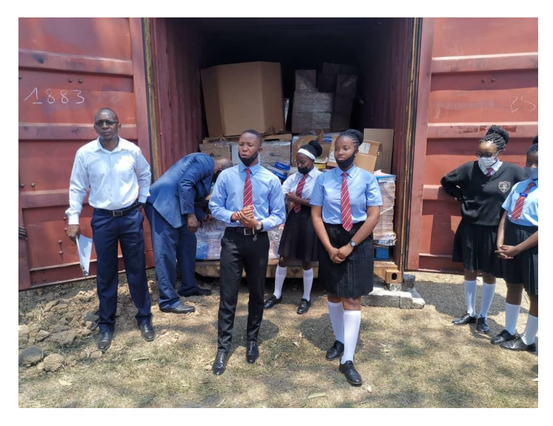
Exhibit 6: School Head Boy Addresses the gathering