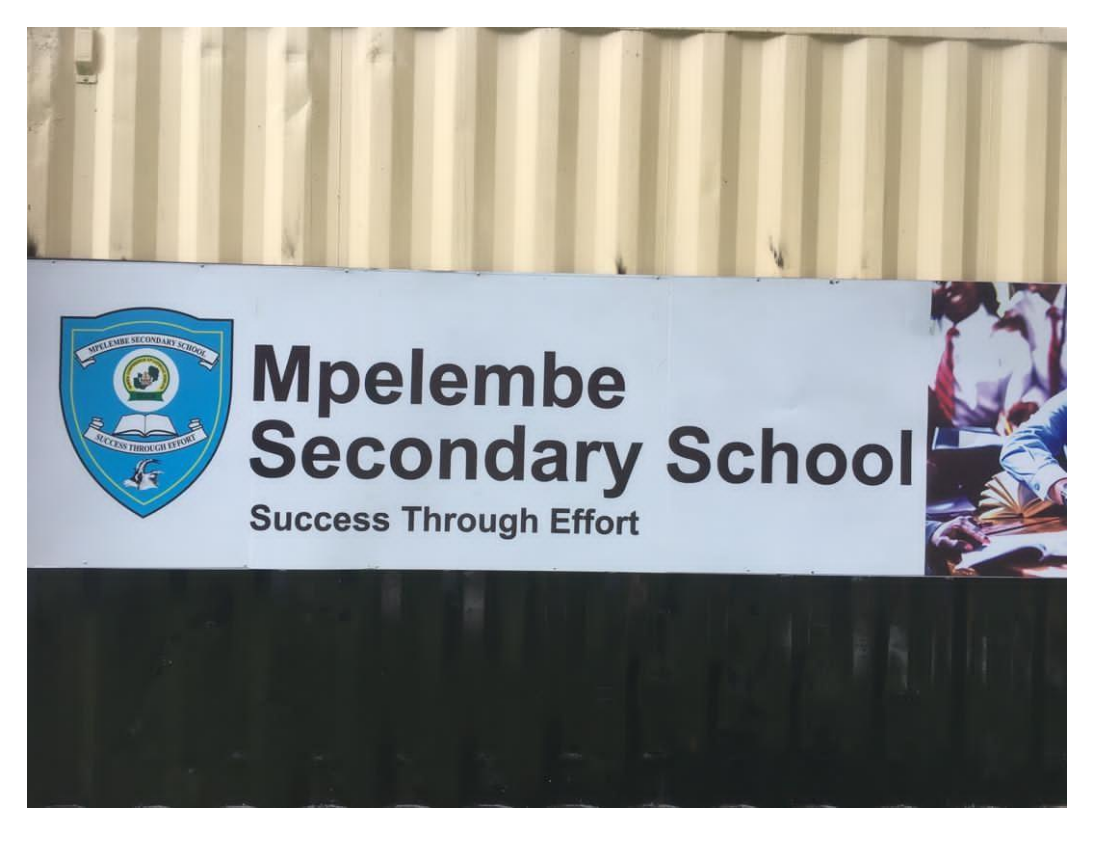
Exhibit 7: Mpelembe Logo put on the container