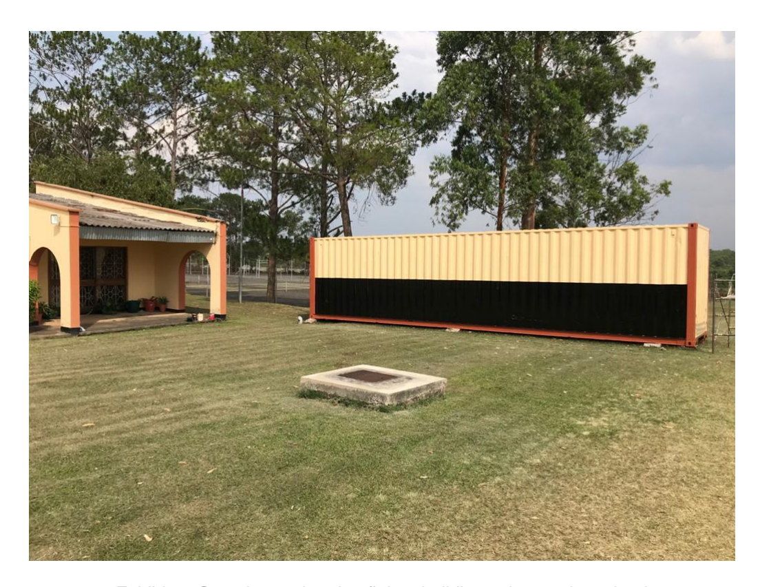
Exhibit 7: Container painted to fit into building colors at the school