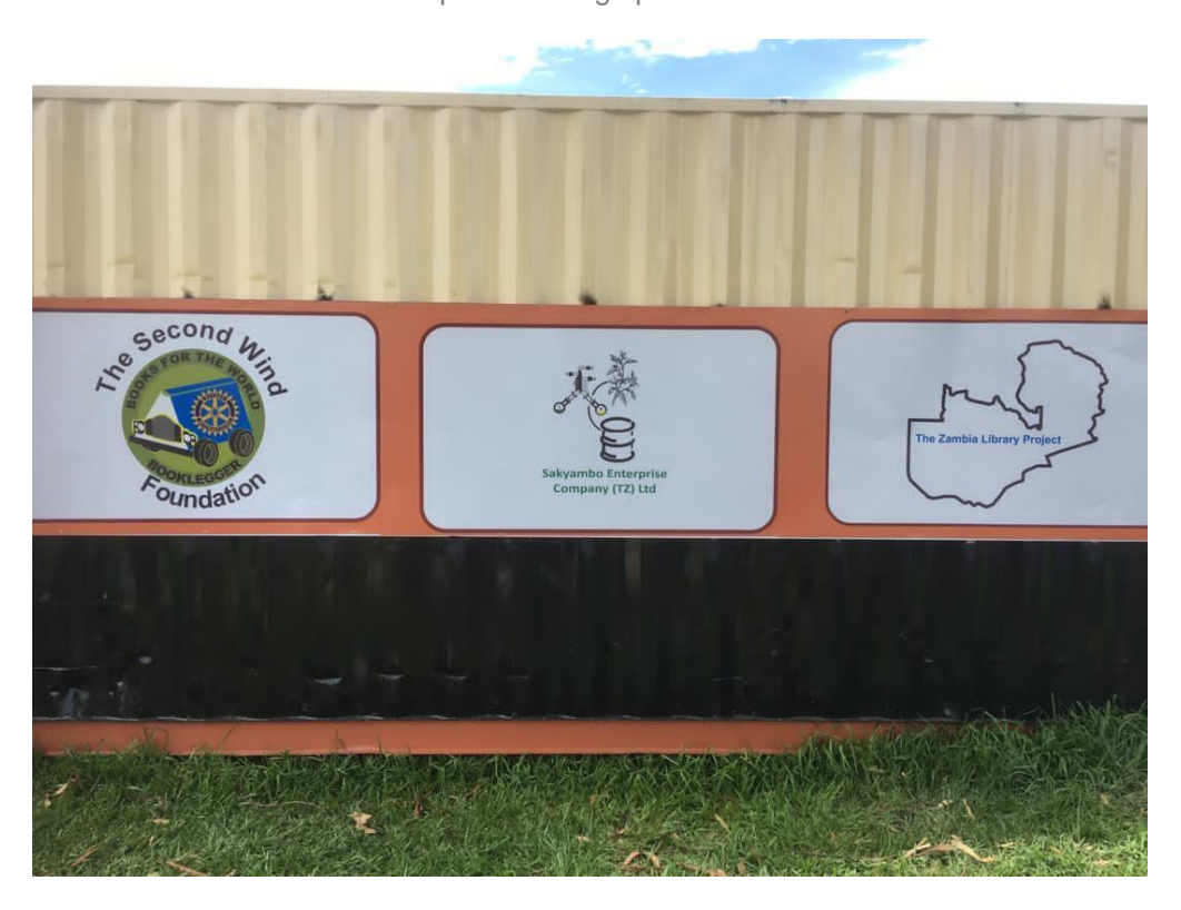
Exhibit 8: Logos of the Second Wind Foundation, Sakyambo Ltd and the Zambia Library Project